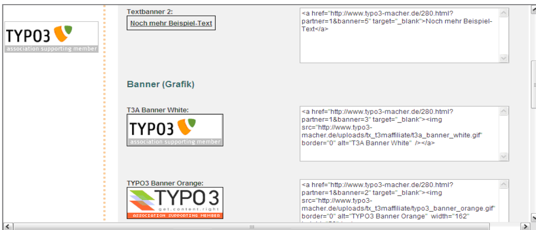
Illustration 2 - Selecting Advertising Materials